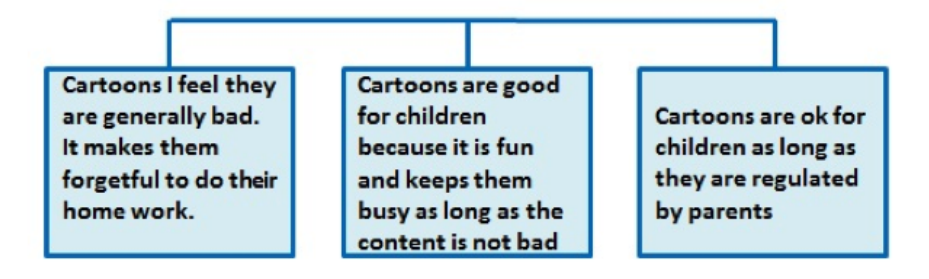
Figure 3: Parents General Opinion on Cartoons?

The above figures shows the views of the respondent (children) from the focus group discussion carried out.